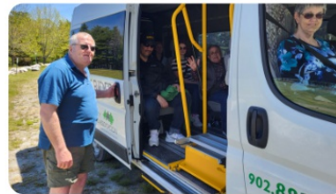
Class trip to Oakfield Park Zoomster - 2023 Kia Sportage

We had two (free) Christmas shopping trips for seniors this December. The Community Rider transported more youth than ever before – ridership under the age of 18 was over 22% of our service this year! We increased the number of deliveries for businesses and families, including groceries, frozen meals and items from the food bank. This demonstrates the versatility of our service – it's for people of all ages and for any purpose you can imagine!