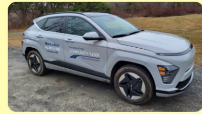
Electra - 2024 Hyundai Kona