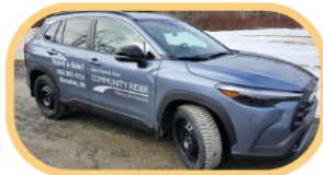
Toto - 2025 Toyota Corolla Cross

The Community Rider also made a difference through food delivery this year. Whether it was freezer meals from the Community Garden, a hot Community Lunch cooked by our garden team, or food orders from the Food Bank, our drivers have helped make food more accessible in our community.