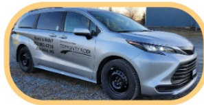
Sunny - 2025 Toyota Sienna